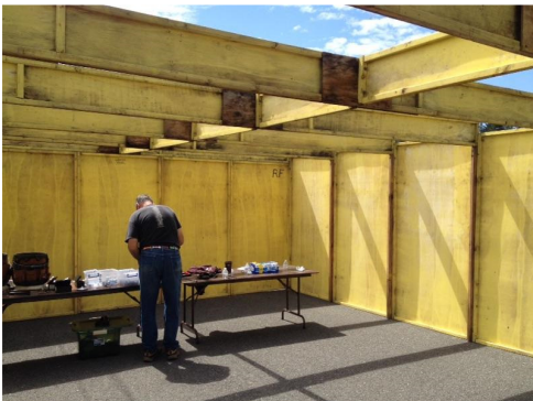
← One of many volunteers working on the air soft pistol booth for Shimpfest, in Brinnon.