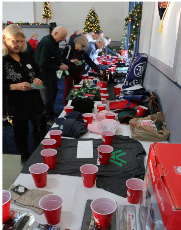
Lots of Door Prizes

“Merry Christmas To All and To All Good Shooting!”