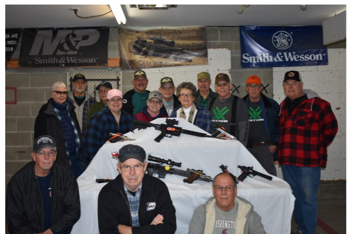
Monday Brunch Bunch! They "volunteered" to pose for a photo to ask for Christmas Party donations!