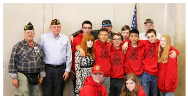
Awards night for the Jr program. Congratulations to all!