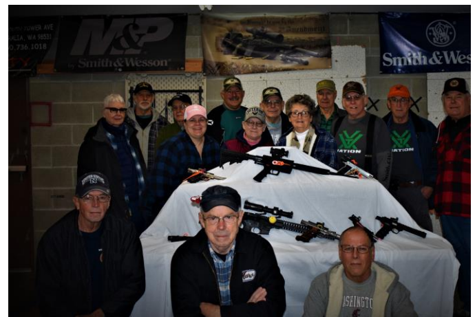
If you've been to a Monday Brunch Bunch, you may have seen some of these members!